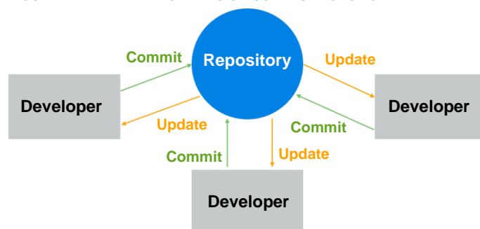
FIGURE 1: AN EXAMPLE OF VERSION CONTROL FUNCTIONALITY

For less sophisticated models a version control sheet and separate audit trail are essential for good model governance. However, these are only as good as the users who update them each time it is required. Indeed, it is important that managers foster a culture that expects high standards in this area.