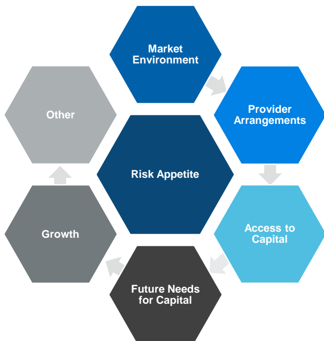
FIGURE 3: CONSIDERATIONS WHEN DETERMINING TARGET SURPLUS

There is no “correct answer” or “one size fits all” with regard to the appropriate target surplus level for a given company; therefore, actuaries must consider several factors when determining the appropriate level of surplus through capital adequacy studies. Any reasonable capital adequacy assessment involves projecting surplus over a time horizon (typically five or more years) by running numerous simulations, as well as varying certain key variables that affect the company’s net income. The target surplus is generally the level at which the probability of a company going insolvent over the selected time horizon is less than the threshold the company’s management feels comfortable with. Some of the significant considerations when performing capital adequacy assessments are described in this section.